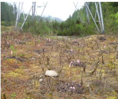
Completed invasive Scotch broom removal, fuels reduction, and replanting.