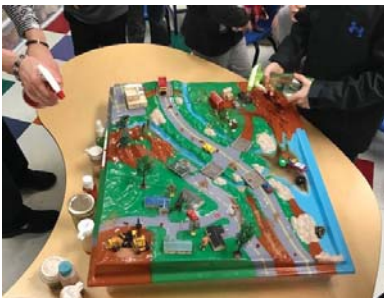
Presented stormwater lessons at 35 classrooms and five events with over 1,500 participants.