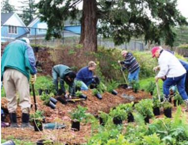
Constructed Bay View Methodist Church rain garden and compost sock terrace, and hosted volunteer planting.