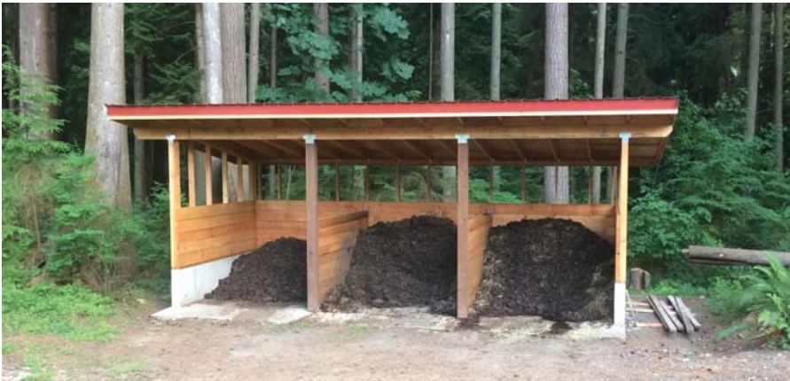
Waste storage facilities: Storing manure in a covered structure on a non-erodible surface reduces the potential of polluting surface and groundwater.