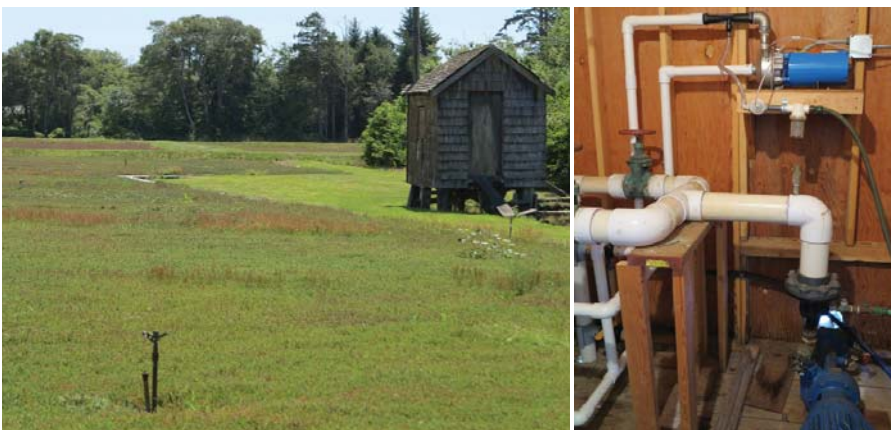
Chemigation units: This upgrades irrigation systems to allow for more efficient application of chemicals to cranberry bogs and reduces runoff to shellfish growing areas.