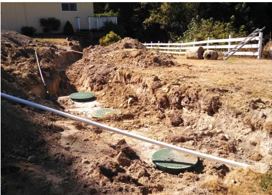
On-site septic system repair or replacement: Failing septic systems have proven to be a significant source of water pollution in some shellfish growing areas.