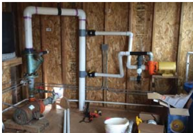
Still helping Cranberry Producers and cattle producers.