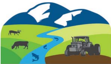
ASOTIN COUNTY Voluntary Stewardship Program Asotin County Voluntary Stewardship Plan was approved.