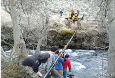
Largest Conservation Reserve Enhancement Program contract enrolled in Asotin County: Asotin Creek - 135.88 acres and 33,500 feet of stream. Photo shows pipe bridge being installed.