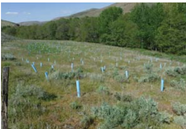
Completed planting to establish a larger corridor of riparian vegetation. This will promote healthy riparian and stream processes.