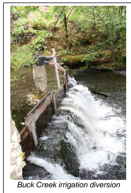
Buck Creek irrigation diversion