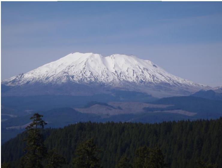
Mt. St. Helens

Washington Conservation Districts assist land managers with their conservation choices.