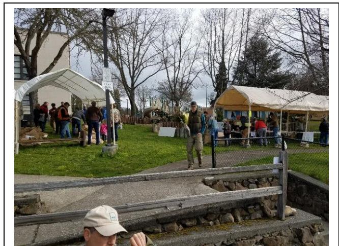
2017 UCD TreeFest and plant sale