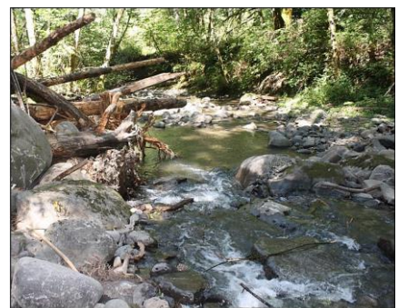
Little Wind River Habitat Restoration Project