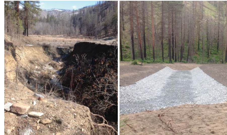
Repair of the flood-damaged Wenner Lake overflow channel and Benson Creek Irrigation Water Users Association headgate. Damage was caused as a result of post wildfire flash flooding following the 2014 Carlton Complex Fire.