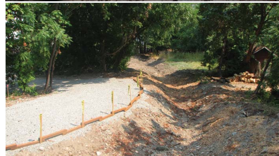
A large debris flow affected three landowners and deposited nearly four feet of mud, rock, and debris on the uphill side of one home after the 2015 First Creek Fire. This project installed a debris flow/flood channel for a drainage on the south shore of Lake Chelan. The project was a partnership between the Cascadia Conservation District, SCC, and USDA Natural Resources Conservation Service through the Emergency Watershed Program.