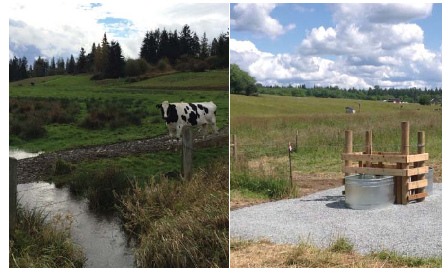
Livestock off-site watering facility. Construction of fencing and watering facilities prevents livestock from having the need or ability to access streams that drain into shellfish areas.