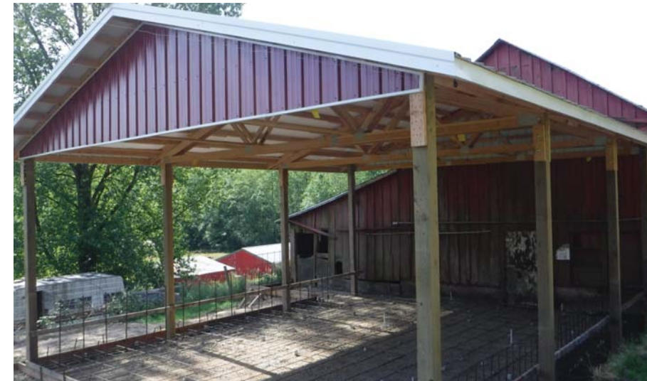
Livestock heavy use area. Installation of roof structures and stable, non-eroding surfaces helps protect and improve water quality.